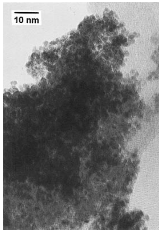
Figure 2. Transmission electron micrographs of sonochemically produced Mo 2 C.

remains an important challenge for non-platinum catalysts. 19,20